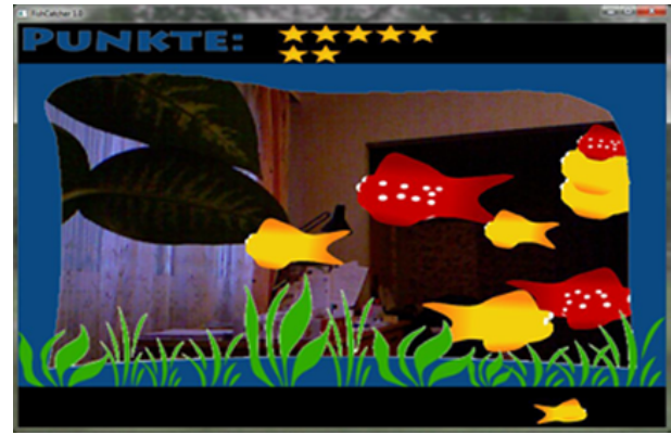
Fig. 1. Yellow and red fish are swimming, the stars specify the current score and the little fish at the bottom shows the remaining time

One game lasts 30 seconds, and, during this time, the players try to catch as many yellow fish as possible, while avoiding touching the red fish. The remaining time is shown by a small yellow fish at the bottom of the window. When the game starts the fish is located leftmost at the bottom. During the 30 seconds, this fish moves to the right side. After that time, the fish is located rightmost, which signifies that the game is over. After one game is over the users can take a break and decide whether they want to continue playing or not. Furthermore, the player can choose between three different levels of difficulty. The easiest one contains the fewest amount of yellow fish and also of red ones, while the most difficult level consists of the biggest number of yellow and red fish, respectively. Another difference between those three levels is the velocity and the size of the fish. The fish in the simplest level are swimming slower and are bigger than the fish of the most complex level. In the medium level, the numbers of fish, the velocity as well as their size are in between the two others.