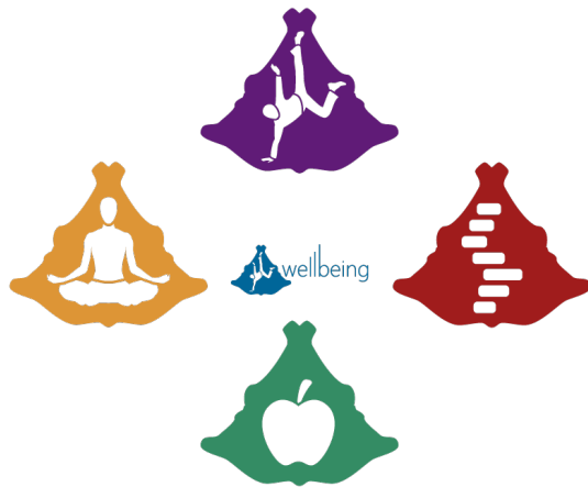
Figure 1. Wellbeing platform and modules